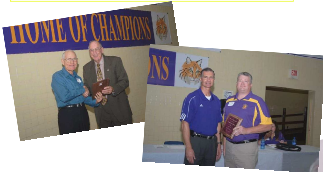
2009 Distinguished Alumni

Distinguished Alumni Presentation & Dinner—5:00PM Beef & Chicken Fajitas w/all the trimmings, dessert, drink High School Cafeteria